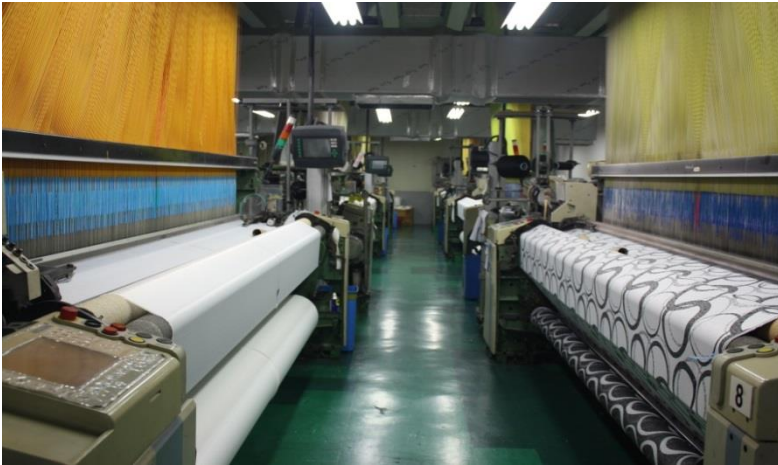
Weaving variety type of Pattern