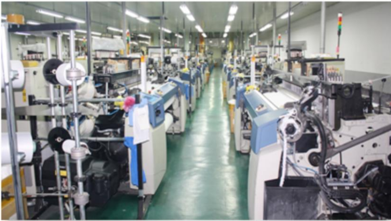
Weaving variety type of stretch textile