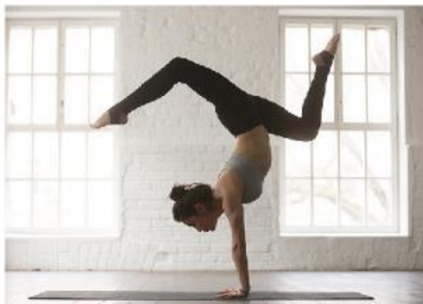
Yoga & Studio