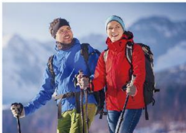
Hike & Explore