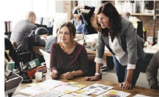
03 Customized service