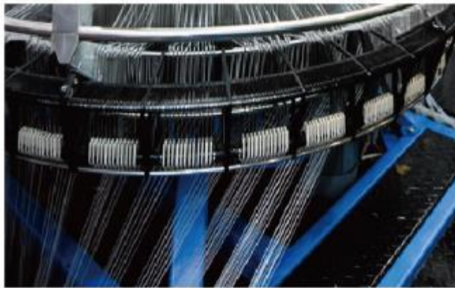
01 Yarn Design (Spin Mill)