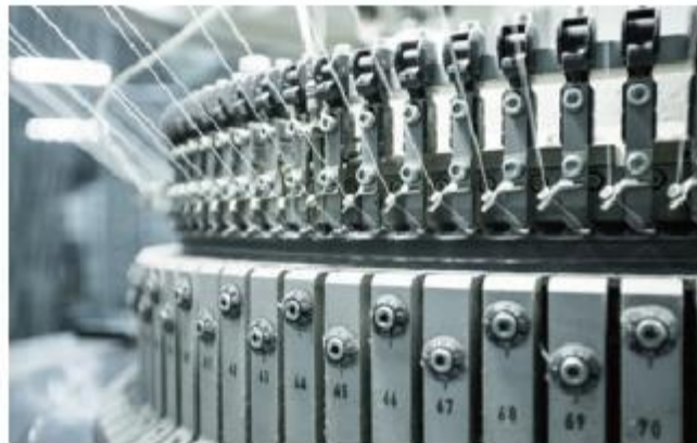
02 Fabric development and design (Fabric factory)