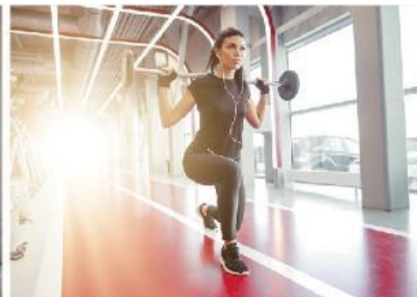
Gym & Training