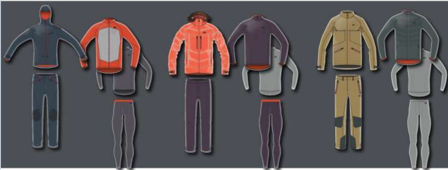
Ski Mountaineering Concept