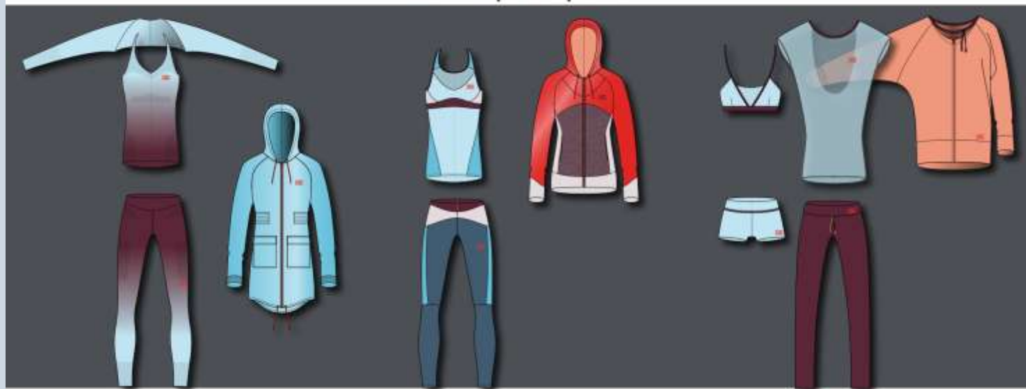
Yoga 3D Concept