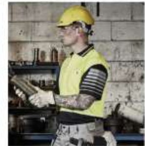
Workwear (coming end of 2017)