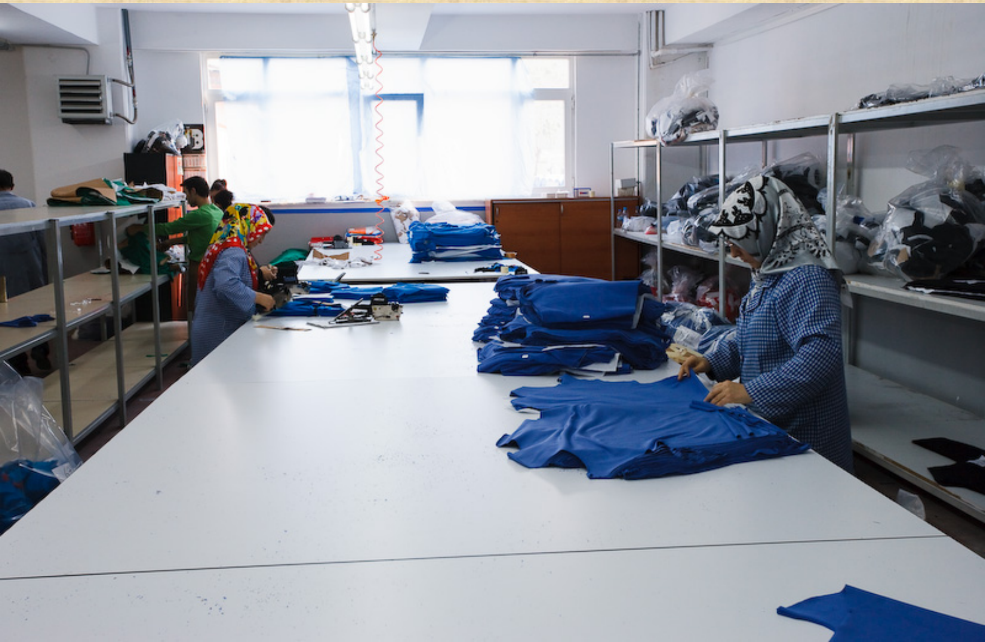
CUT PIECE LABELING