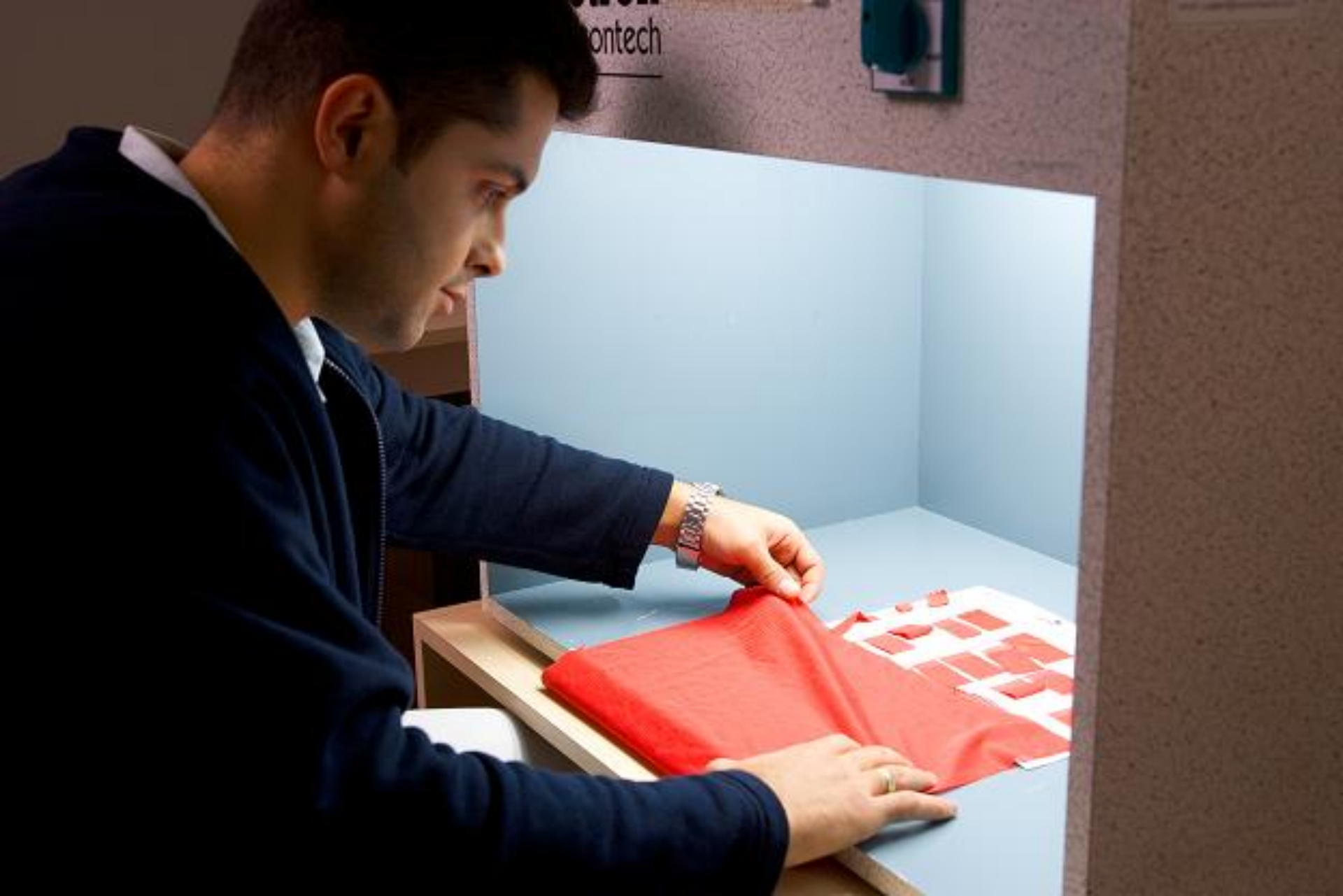
color continuity check at lightbox