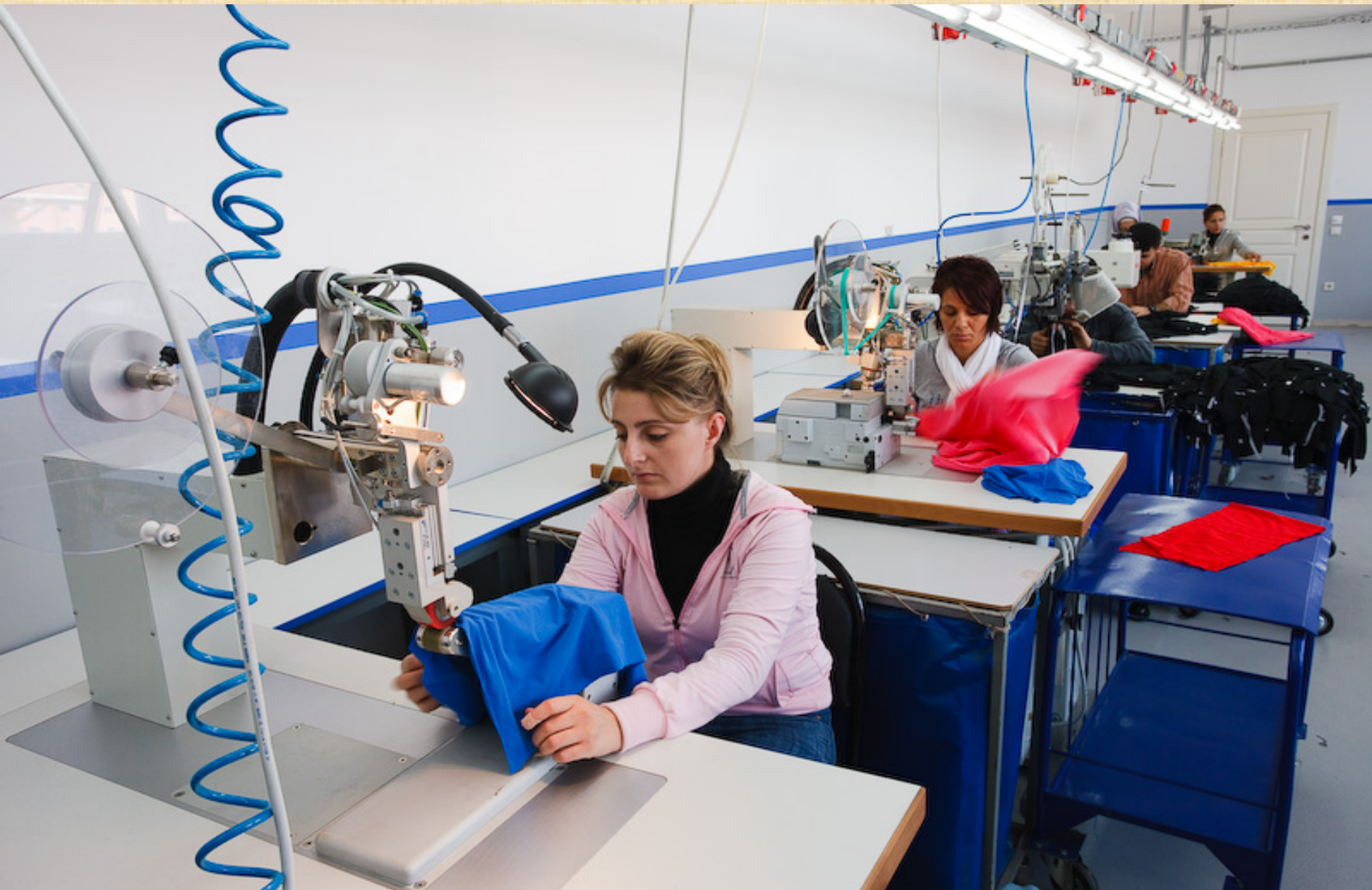
WELDING & GLUING & TAPING