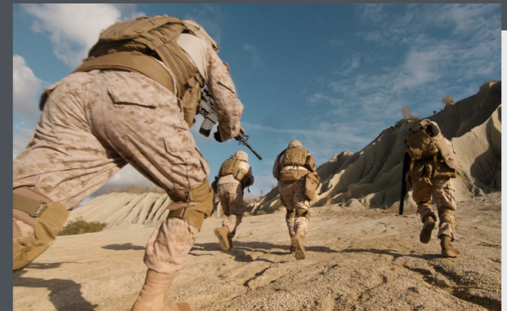
2019 ITTTAI expand its markets on Professional and Military sectors