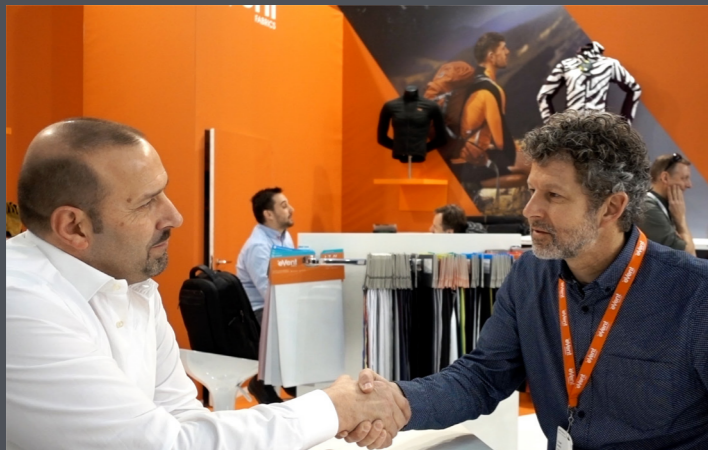
2011 ITTTAI's owner and eVent® Leadership secure exclusivity agreement.