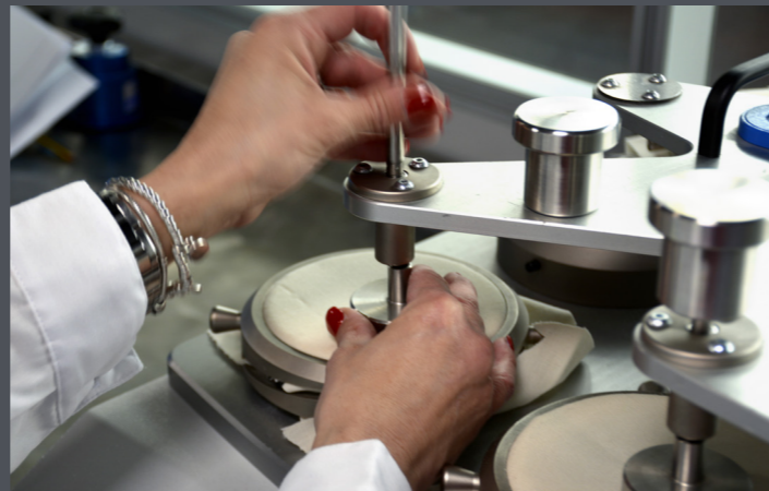
2015 ITTTAI LAB born date to approach new technologies challenges