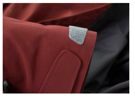
Bonded stiff velcro wrist closure. / LB600