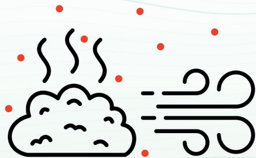
UNPLEASANT ODOR + ODOR RELEASE