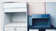
★ light box

Shaoxing Fashion Leader Textile&Garment Co., Ltd