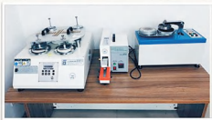
★ testing lab