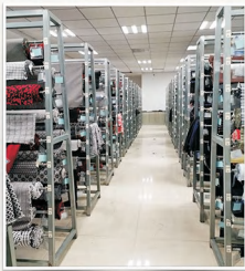
★ show room