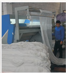
★ greige inspection