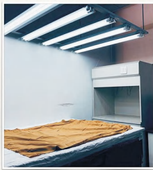
★ inspection workshop