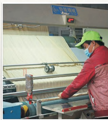
★ product inspection