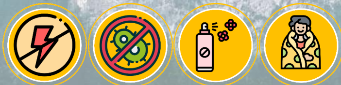
Anti-static Anti-bacterial Odor Control Thermal