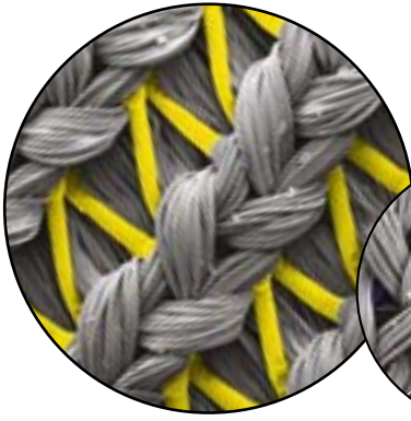
80% nylon 20% XLANCE® no breakages

PA6-based warp-knitted fabrics containing either 20% XLANCE® or 20% Spandex dipped in a 4-ppm-chlorine solution while under continuous dynamic stretch for over 200h.