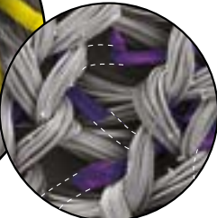
80% nylon 20% spandex breakages

Images of competition garments containing either XLANCE® or spandex after 5 months of swimwear test: XLANCE® remains fully intact while spandex fiber is broken and fragmented by oxidative degradation.