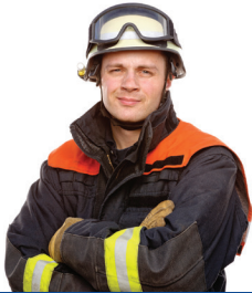
ToughCrusher ® Industrial Wear

Work wear made by Sapphire fabrics is practical, smart and durable. It meets performance requirements and offers optimum functionality. Our wide fabric range ensures that all specialized work wear needs for diverse sectors is catered to. We design work gear keeping in mind practical considerations so that the wearer is able to perform tasks efficiently and safely and most importantly be comfortable in what he/she wears.