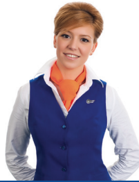
Frontline ® Institutional & Uniform Wear