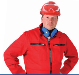
SmartGarment ® Innovations